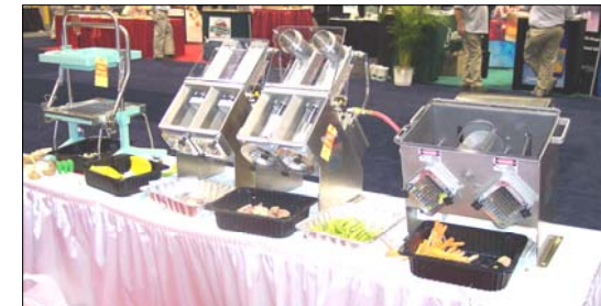
Shown with Standard 3/8" blades