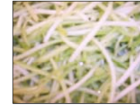
Shown with Available Square Bottom & w 1/2" Blades