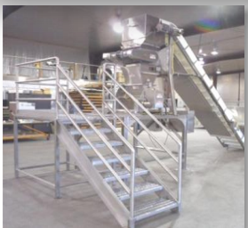
Decks breaks down for shipping.